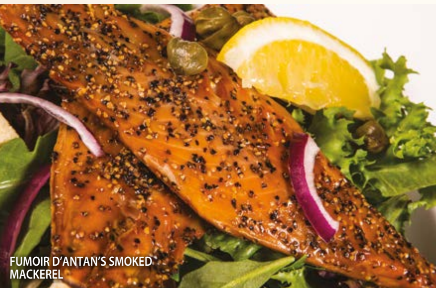
FUMOIR D'ANTAN'S SMOKED MACKEREL

THAI CHICKEN 22.95 (chicken breast basted with a sweet and spicy Thai sauce, served on a bed of seasonal lettuce blend, with red peppers, red onions and chow mein noodles)