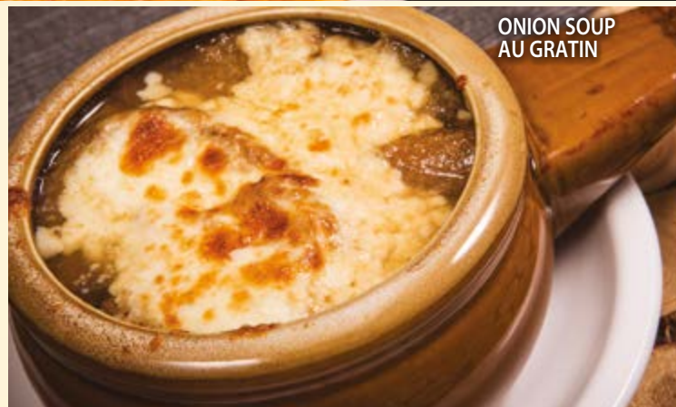
ONION SOUP AU GRATIN